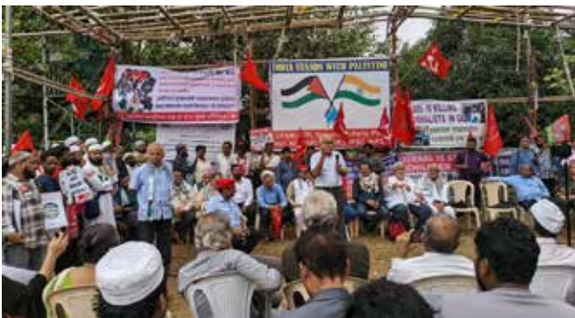
Indians denounce the crimes of the Zionist regime