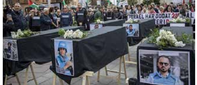
The people of Sweden join their voices with other nations