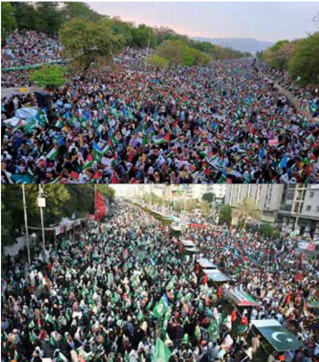
Pakistani people, pioneers in supporting Palestine