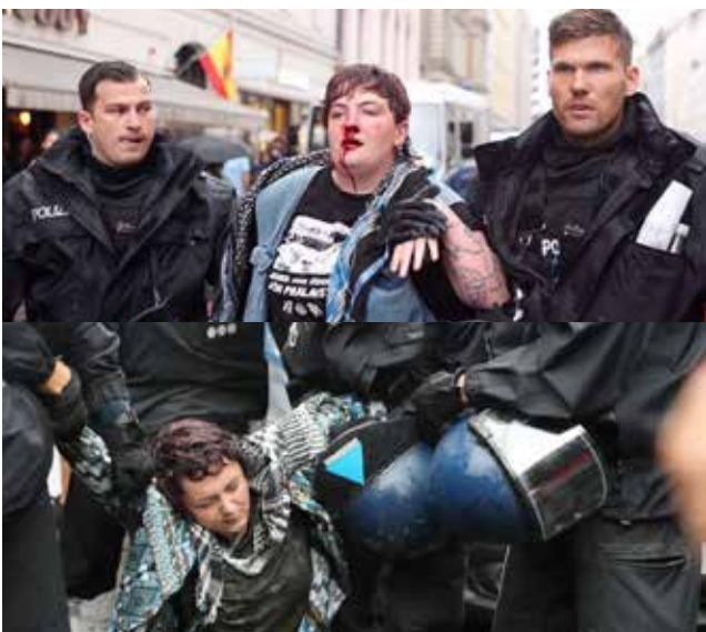
Awakened consciences in Germany